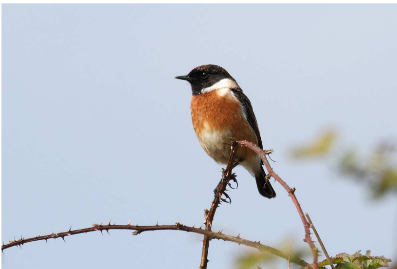
Stonechat seen on Croston Moss and on the Moors

Winter flocks continued to be recorded. 100+ Skylark were on Croston Moss (2 nd ) and 80 were on Mawdesley Moss ((6 th ). 200 Starling were at Rivington (1 st ) and another 200 were at Withnell Fold (23 rd ). 100 Fieldfare were on Croston Moss (3 rd ), 40 were along the Yarrow at Eccleston (22 nd ) and 200 were at Withnell Fold (27 th ). Around 100 Redwing were at Euxton (4 th ) and 200 were at Eccleston (8 th ). 60 Pied Wagtail were at Croston Sewage Works (14 th ). The linnet flock on Croston Moss was around 100 birds on the 7 th . Goldfinch flocks included 45 at Euxton (15 th ) and 40 at Withnell Fold (27 th ).