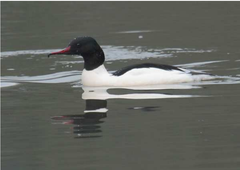
Goosander at Common Bank Lodge

A Little Egret roaming the ditches on Croston Moss was a good find for one observer on the 1 st . It was seen again on 3 rd and 13 th . Pink-footed Geese were still feeding on the moss with 150 on the 1 st reducing to 50 by the 14 th . Return passage from East Anglia was evidenced by flocks of 80 over Eccleston (4 th ), 20 over Euxton (6 th ), 200 over Yarrow Valley Park (6 th ) and 700 over Coppull (9 th ). A Whooper Swan was on Croston Moss (7 th ), 3 flew low over Eyes Lane (14 th ) and 5 flew over Yarrow Valley Park (15 th ). 20 Greylag Geese were on Lower Rivington Reservoir on the 8 th and 40 Canada Geese were at Yarrow Valley Park (1 st ). Shelduck had started to move inland with 6 on Croston Moss (7 th ) and an impressive 52 along Eyes Lane on the 18 th . The female Shoveler of suspect origin continued to reside at Yarrow Valley Park, where Tufted Duck numbers peaked at 15 on the 1 st . Tufted at Croston Twin Lakes numbered 11 on the 15 th . 2 Gadwall were at the site on the 23 rd . The single Pochard remained at Anglezarke, and Mandarin were again noted at both Arley and along the Yarrow at Eccleston.