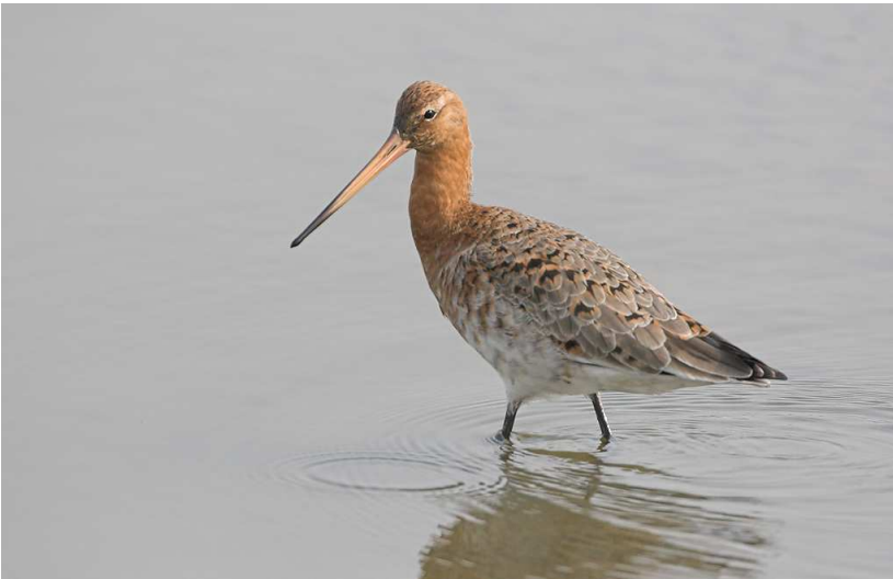
Black Tailed Godwit

The last Whooper Swan record was of 15 flying over the Yarrow at Eccleston (14 th ). The last Pink-footed Goose record was even earlier on Croston Moss on the 4 th . A surprising sighting was of 3 Barnacle Geese on Croston Twin lakes between 24 th and 27 th . Mixing with Canada Geese they were of suspect origin but there were no further records from the general area after they had left. Three Shelduck were at an inland site at Brindle (1 st ). 53 were along Eyes Lane on the 5 th . 2 Gadwall were on Croston Moss (15 th ) and a Wigeon was there on the 31 st . Teal numbers peaked at 40 at Withnell Fold (6 th ) reducing to 20 by the 25 th . Goosander included 13 on Yarrow Reservoir (1 st ), 18 on Common Bank Lodge (5 th ) and 10 on Anglezarke Reservoir (8 th ). 4 on the Yarrow at Croston on the 3 rd were probably part of the breeding population. A Little Grebe in Cuerden Valley Park on the 10 th was the first for several years. A Water Rail was at Arley nature reserve on the 14 th . First breeding record was of a Mallard with 9 young at Ulnes Walton on the 20 th .