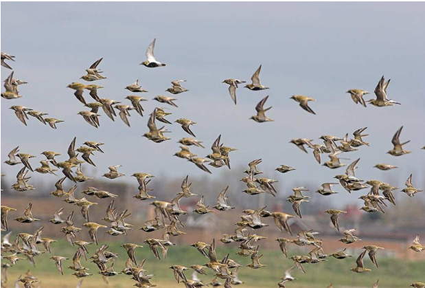
Flocks of Golden Plover included 11 on Croston Moss (17 th ) and 53 there (20 th ).

Including Grey Heron at Yarrow Valley Park, seven species of wader were recorded. Green Sandpiper were seen both on Syd Brook (2 nd & 20 th ) and at Croston Twin Lakes (18 th ).